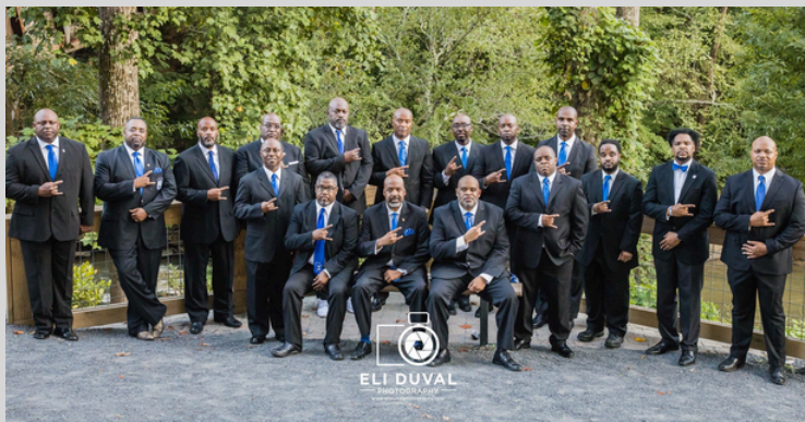
Sigma Delta Sigma Chapter Woodstock, Georgia

Congratulations to the following chapters who have excelled in Educational Programming for the 2nd Quarter. They have proven evidence of Adopt A School, STEM Programs, Collegiate Push, and Scholarship.