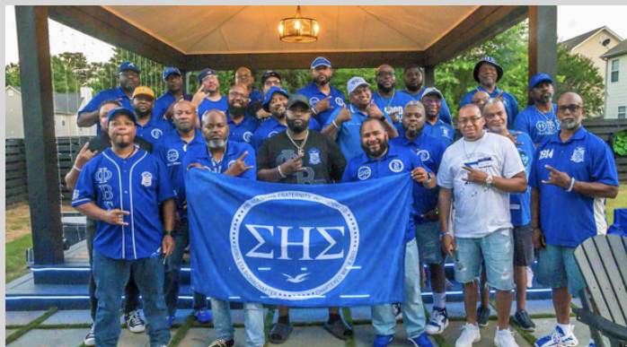
Sigma Eta Sigma Chapter McDonough, Georgia