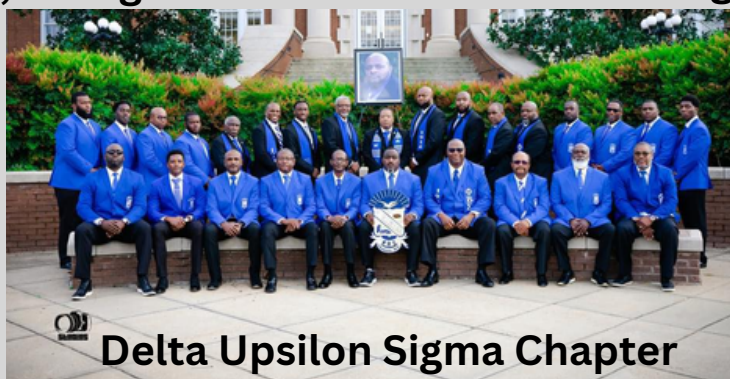
Delta Upsilon Sigma Chapter Starkville, Mississippi